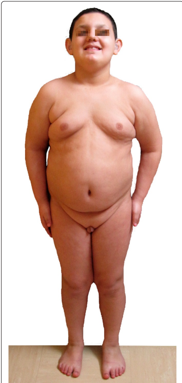
Fig. 1 Morphological appearance of the patient at 15 years of age. Gynoid habitus, abdominal fat, pseudogynecomastia (presence of only adipose tissue), hypoplastic genitalia with microtestes (volume of 2 ml), generalized hypotonia, genu valgus, pes planus, short toes

available upon request. The PCR products were visualized on a 2 % agarose gel and purified using ExoSAP-IT enzymatic PCR clean up system (Affimetrix, Santa Clara, CA). The purified products were then sequenced with the Big Dye Terminator kit (Applied Biosystems, Foster City, CA) and the automatic sequencer ABI PRISM 3100 Genetic Analyzer (Applied Biosystems, Foster City, CA).