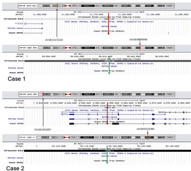
Fig. 3 Chromosome breakpoints and disrupted genes. Breakpoints are indicated by red and green arrows. No genes were disrupted by any of the breakpoints in case 1 or by one of the breakpoints in case 2. The second breakpoint in case 2 on the long arm of chromosome 18 disrupted METTL4

In the present study, we found two suspected cases of r(18) by GTG method (Fig. 1a), then used low-coverage whole-genome paired-end NGS to characterize the cases at a high resolution. We identified chromosome deletions on both arms, and the chromosome junctions at a resolution level of hundreds of base pairs. We also validated the chromosome deletions by SNP-array analysis, and used Sanger