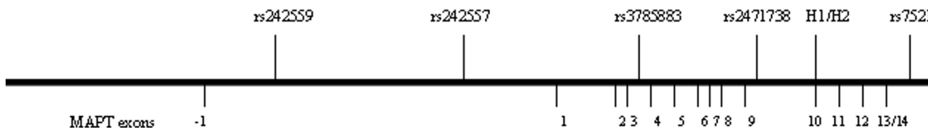
Figure 1 Scheme of MAPT genomic structure showing the position of the 6 SNPs genotyped.

Hardy-Weinberg equilibrium (HWE) was calculated for the 6 htSNPs genotypes in the control population using \chi^2 statistics. We set a significance level of 0.01 in order to take into account the number of tests performed. We assessed pairwise linkage disequilibrium (LD) between the 6 htSNPs using D' and r^2 calculated from the expectation-maximization estimated haplotypes (Figure 2). We used the program SNPStats [30] for the LD analysis. Single locus analyses were performed using SPSS software version 13. Allelic and genotypic frequencies were compared using \chi^2 statistics. Adjusted analyses were performed using multiple logistic regression analysis. Age, gender and