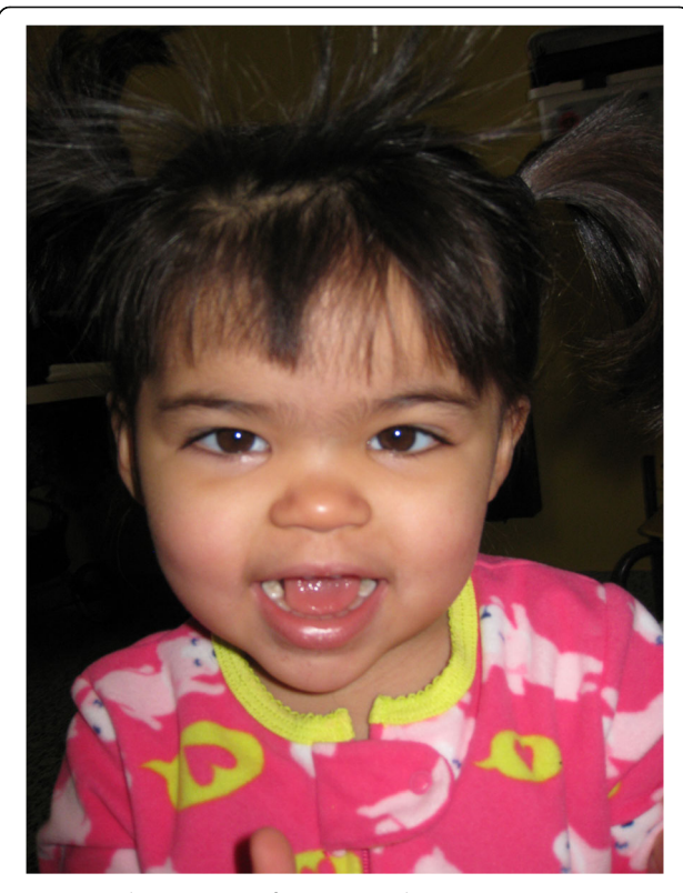
Fig. 2 Facial appearance of patient 1 with SLC35A2 mutation

Clara, CA) was used for sequence enrichment and the resulting libraries were sequenced on an Illumina HiSeq 2000 instrument (Illumina, San Diego, CA). Paired 100 base reads were mapped and genotyped using a custom informatics pipeline. The patient was found to have a mosaic