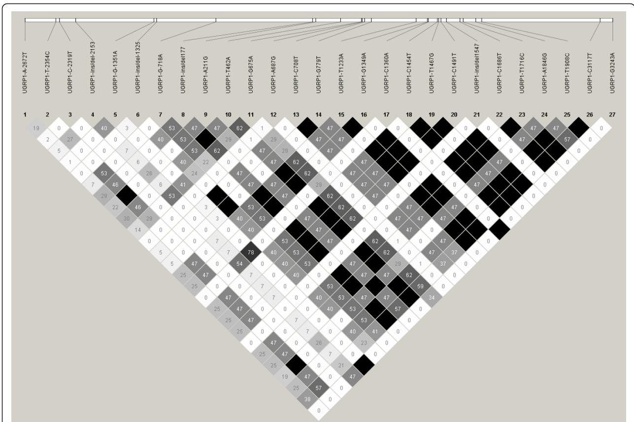
Figure 1 LD block of the Singapore Chinese population for the UGRP1 gene. Linkage disequilibrium block generated using SNPs identified in the UGRP1 gene. Figure generated using Haploview 4.1 and the values denoted in the boxes represent R^2 values which are a measure of the linkage between SNP pairs.